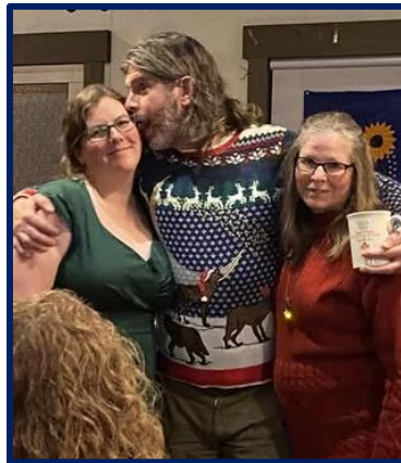
The Axios Crew!

As we close out the current year and look forward to 2025, my family and I are headed to Key West in search of new nautical adventures. The best to you and yours as we sail into 2025!!!