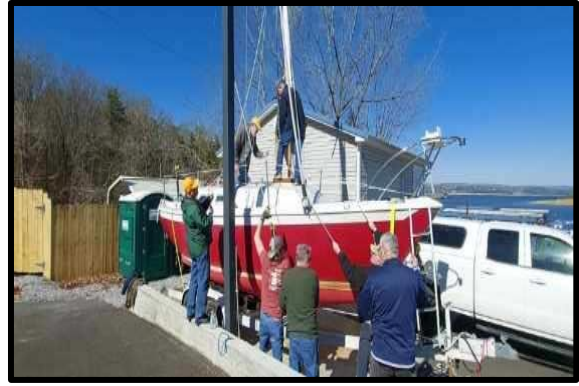
First Boat To Use the Gin Pole