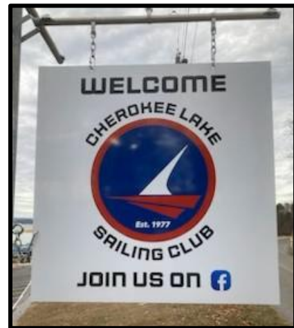
New Signage at Entrance of Marina