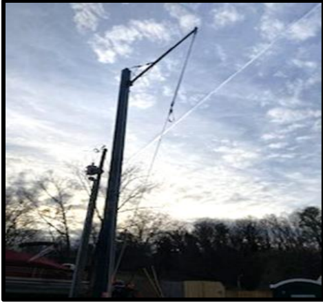
Club Gin Pole for Member Use